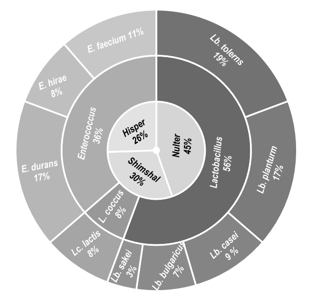
Figure 2. Biodiversity pie chart of lactic acid bacteria (LAB) isolated from raw yak milk collected from 3 different sampling areas in Pakistan; the inner ring shows the distribution frequency from areas; the middle ring shows the percentage of each identified genus; the outer ring shows the percentage of isolated species.

A total of 88 Gram-positive and catalase-negative isolates considered as presumptive LAB were purified by successive sub-culturing on their respective media and selected for further identification and characterization. Majority of LAB were recovered from MRS-agar plates as compared to M-17 media. Moreover, MRS further allowed for the isolation of genius Lactobacillus along with the isolation of some species of Enterococcus. Similarly, none of the species of Lactobacillus was isolated from M-17 agar. A comparatively high incidence of LAB was recovered from the samples collected from Nulter (36 isolates), followed by Shimshal and Hisper (28 and 24 isolates, respectively). The distribution frequency of LAB from three different sampling areas is presented in Figure 2 (inner ring).