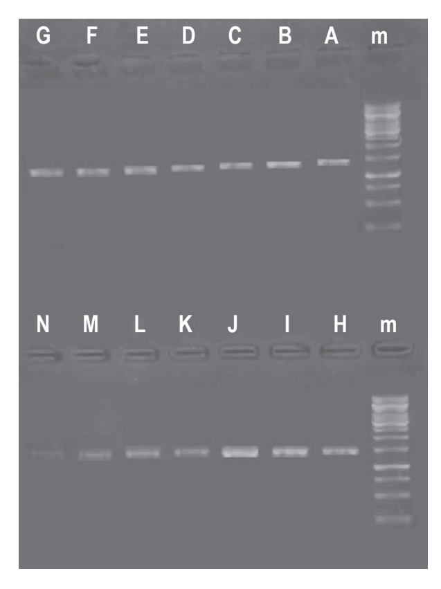
Figure 3. PCR amplified 16S rRNA gene products of the representative isolates of lactic acid bacteria (LAB) isolated from yak milk (A to N) showing 1.5 kb product along with the marker (m) (1 kb; Thermo Fischer Scientific, Waltham, MO, USA).

All isolates yielded a single, clear fragment of 1.5 kb, as shown in Figure 3. Only 30 bacterial isolates that showed promising results for antibacterial attributes during the current study were further identified genotypically through the analysis of their 16S rRNA gene sequencing. Later their probiotic potential was also accessed